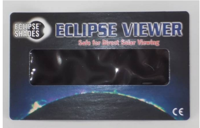
3" x 5" Viewer